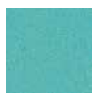
Acqua cod. M002