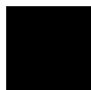
Nero cod. P002