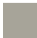
Tortora cod. P004