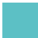
Turchese cod. P003