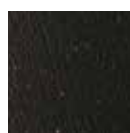
Pietra Lavica cod. G003