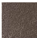
Pece cod. G002