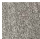
Sasso di Fiume cod. G001